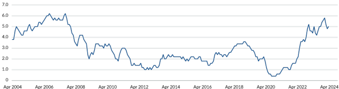
Percentage changes in the 7520 rate over time