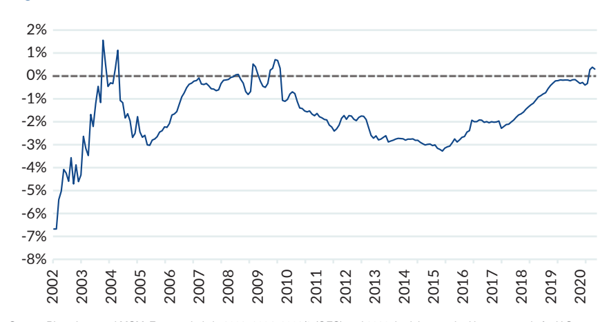
Figure 3: EM HEDGING COSTS (U.S. INVESTOR)

From periods in 2003, 2004, 2008/9 (GFC) and 2020, hedging resulted in a carry gain for U.S. investors. Most other periods resulted in a carry cost. Past performance is not necessarily indicative of future results; actual outcomes may differ. This graph does not illustrate actual client experience or results.