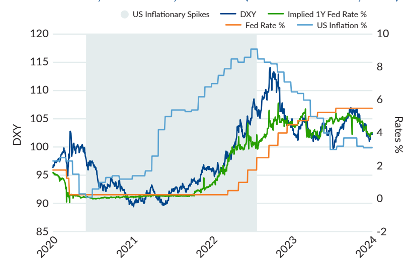
CHART 4: DXY, INFLATION, FED RATE (2020-JANUARY 9, 2024)

Past performance is not necessarily indicative of future results. Actual results may materially differ.